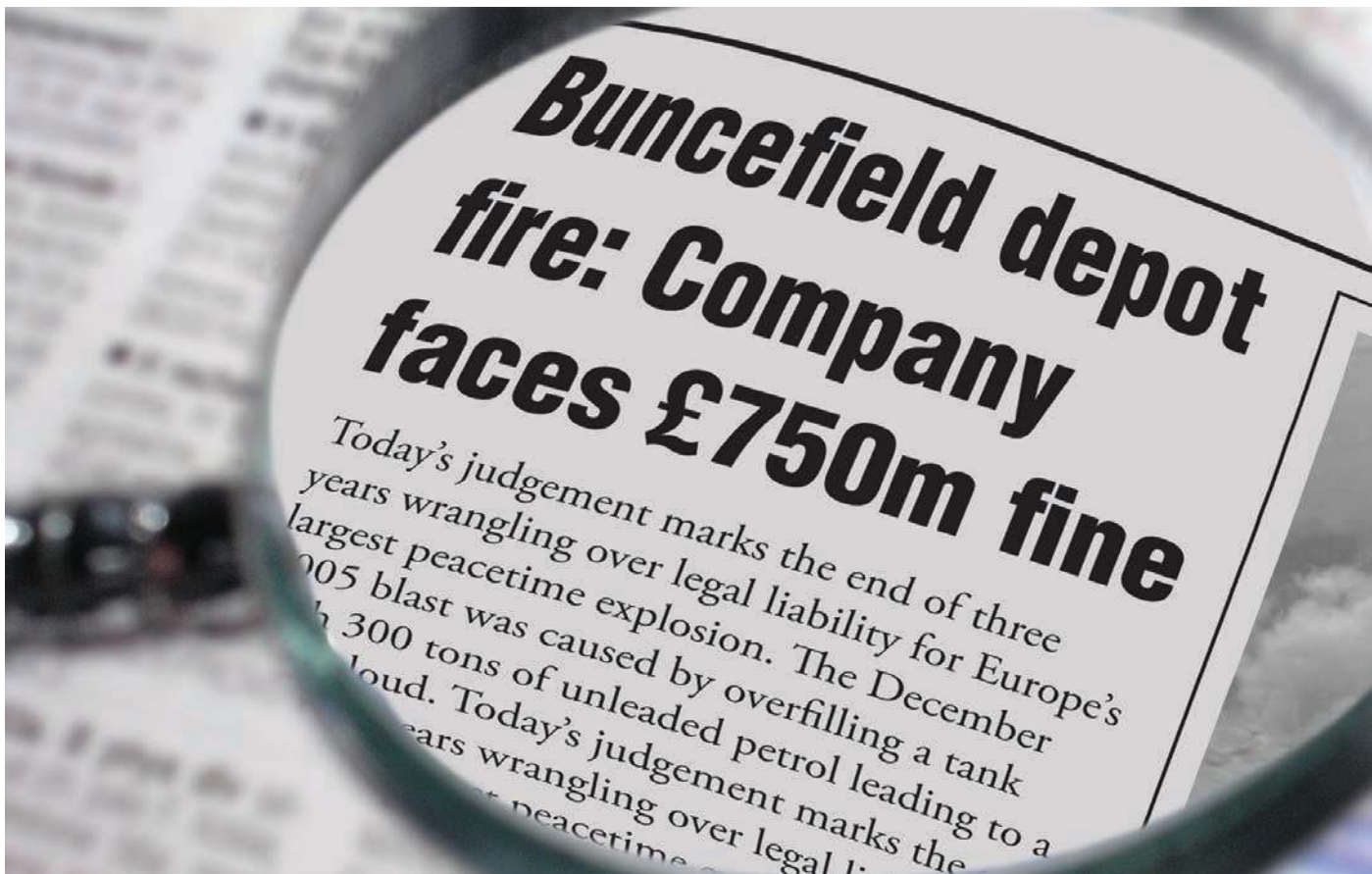
Liquid hydrocarbon leaks can jeopardize safety and damage the environment—both of which can be costly to your reputation and business.